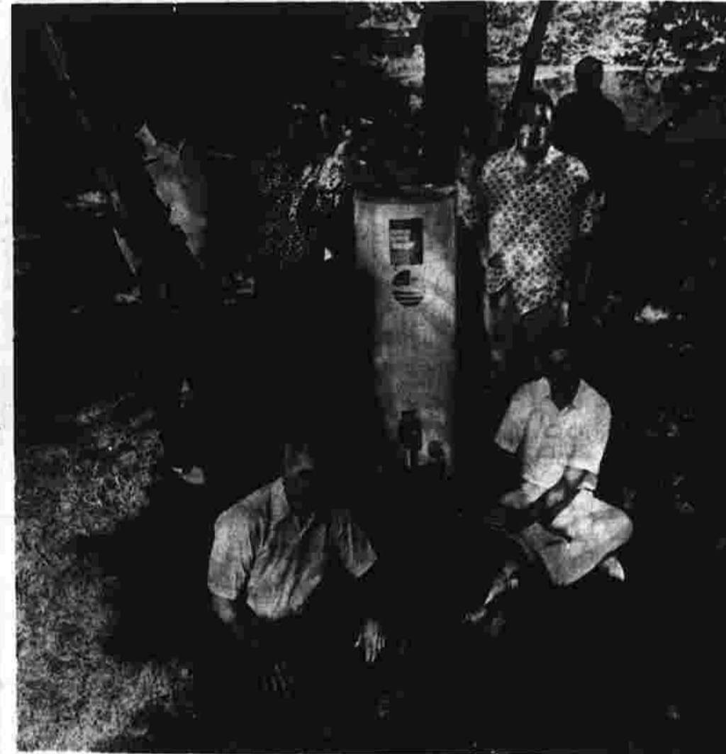
The CNG Conservationists recommend... the A.O. Smith Conservationist Water Heater

You folks who signed up for the Florida trip are reminded that they must start getting their money during the week of the third of January. I might mention that we still have a few more seats open and with our first shot of snow, maybe you would rather be heading south?