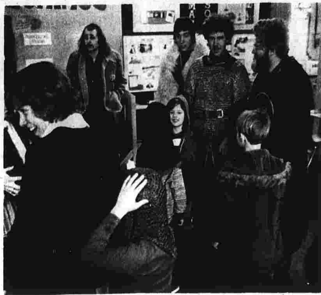
Armor demonstration at Lutz

Boys and girls try on mail helmets and imagine what it must have been like "In days of old when knights were bold and barons held their sway..."